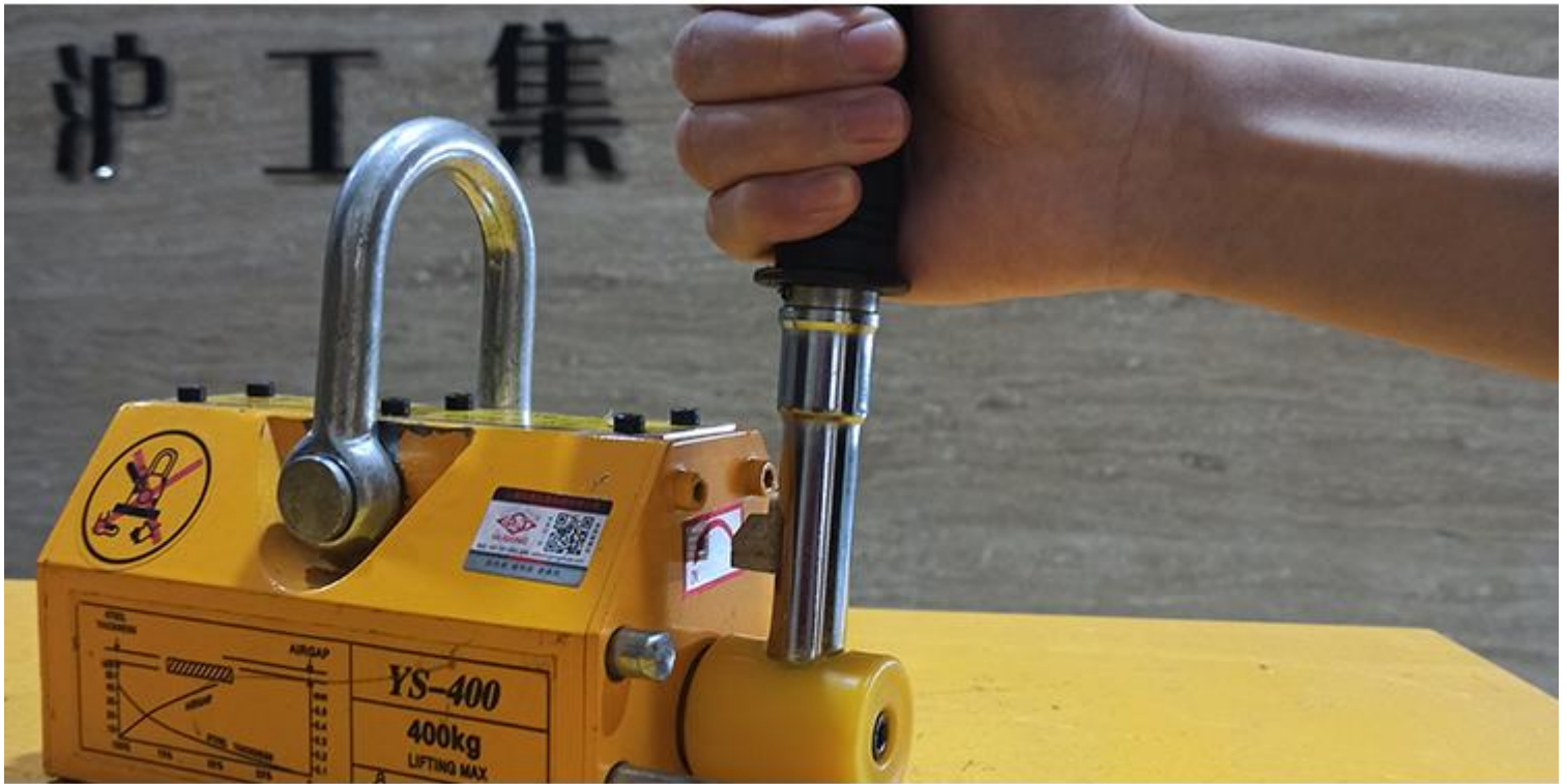
Magnetic Lifter 1 Ton U groove design, both plate and round steel can be absorbed